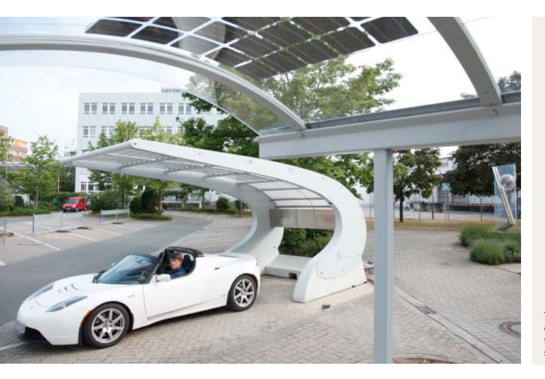
The SUNOVATION ECO TECHNICS carport combines design with functionality in an attractive way. Foreground a PLEXIGLAS® solar roof for the bicycle shelter.

A carport designed for Evonik was recently installed on the premises of the Darmstadt site directly in front of the new lightweight design studio in which Evonik presents sophisticated plastic components for applications in the automotive industry, aviation, solar technology, and architecture. An appropriate environment for the solar carport, which rises upwards in an elegant arch. Its eight-square-meter photovoltaic surface allows enough power to