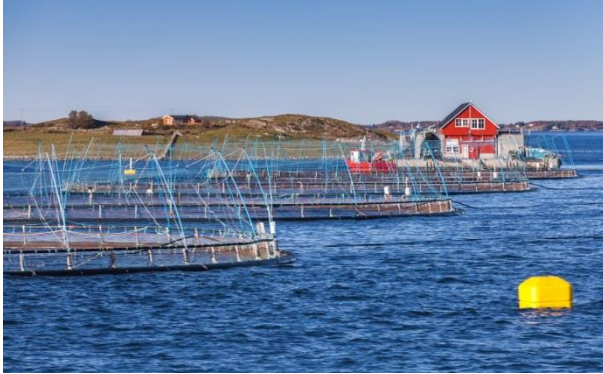
Norwegian fish farm in a fjord near Trondheim, Norway.