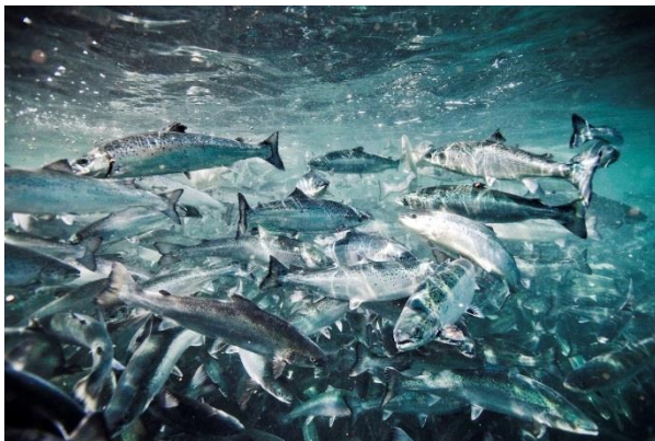
Atlantic salmon (salmo salar) in aquafarm.